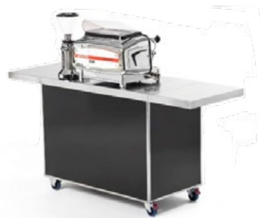
2. Coffee cart