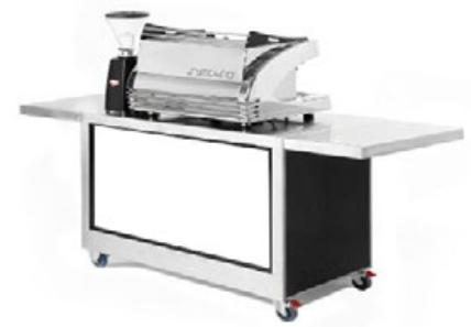
3. Coffee cart with LCD screen