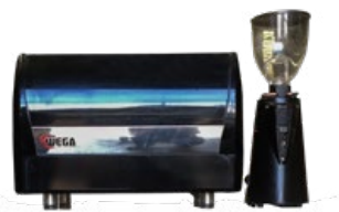
1. Machine hire only

We've selected Coffee Mob as our trusted coffee cart provider.