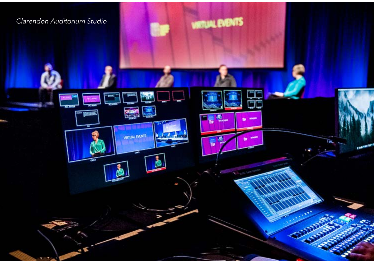
Clarendon Auditorium Studio